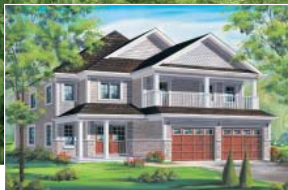
The Willow, Elev. B, one of the beautiful homes available in Dunbury Meadows in Bowmanville.

Dunbury's principals continually draw from their numerous past successes to create thoughtfully planned communities. A team of experienced and talented professionals, the team at Dunbury Homes works hard to offer residents a quality way of life. With their outstanding dedication to ensuring customer satisfaction, Dunbury Homes and all its partners continuously strive to achieve the highest levels of service excellence by which the industry has been judged. To find out more about Dunbury Homes, visit online at www.dunburyhomes.com .