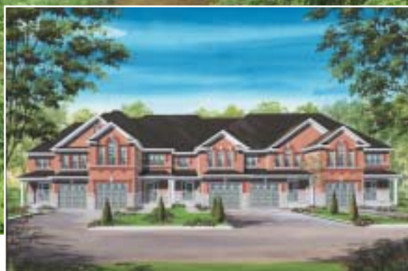
Luxury Townhouses, Dunbury Woodlands in Bowmanville.